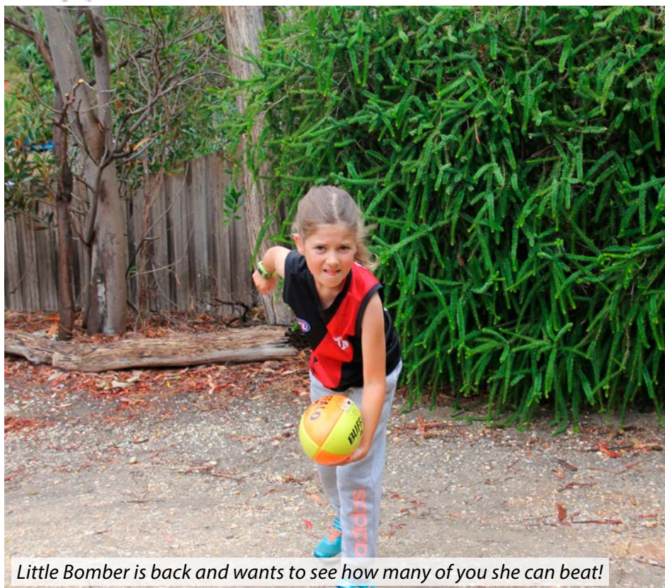
Little Bomber is back and wants to see how many of you she can beat!