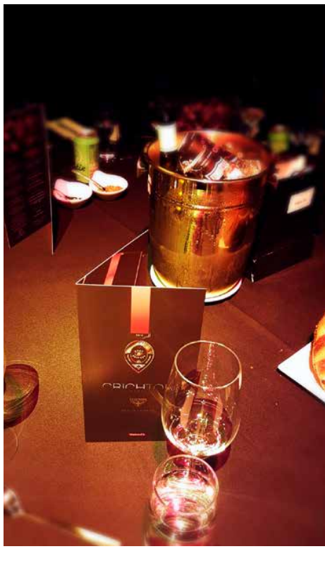
Paper supplied and donated by Ball & Doggett Fine Paper. Printed on 128gsm Sovereign Silk

© Copyright Cariss Printing. No portion of this newsletter may be reproduced without the written permission of the publisher. This newsletter is distributed with the understanding that the publisher is not engaged in rendering any legal or professional advice of any kind. The publisher disclaims any personal liability for the information, advice, recommendations and/or strategies presented within. It is up to the reader to comply with any local, state or federal laws.